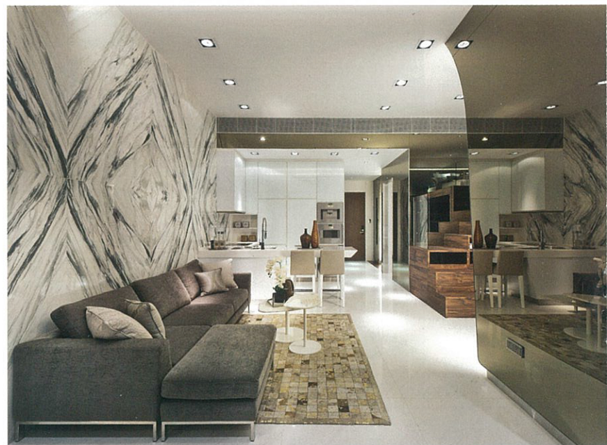
Top: CMD's showflat design for The Scotts Tower. Above: The Scotts Tower's showflat. Facing page, from top: Designing the showflat for Far East's Miro provided CMD its big break; CMD's showflat design for The Greenwich was published in the annual Andrew Martin Interior Design Review .